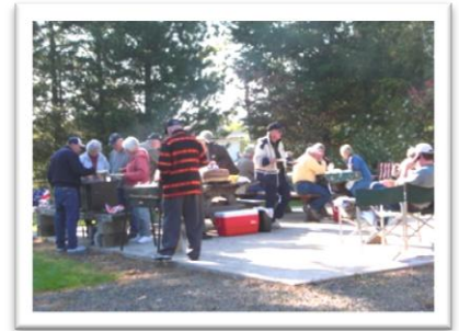
Gourmet hot dog anyone?

took place. After the group settled in, many went for a hike in the Hoh Rain Forest. That night we had a delicious gourmet hot dog BBQ potluck followed by our chapter business meeting where several Foretravel Motorcade Gift Certificates valued from $25 to $100, Foretravel cookbooks, Foretravel hats, baked potato bags and more were awarded as door prizes, thanks to the Motorcade Club in Texas! Last but not least, the group sang happy birthday to three members who were celebrating a birthday.